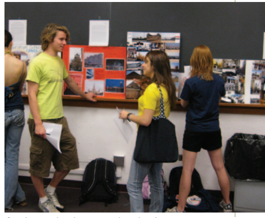
Students check out each other's presentations in the City Showcase.

The experiment was definitely a success. End-of-semester evaluations indicated that this assignment was very popular with the class. When asked, "What was the one thing you would not change about this class?" the most common response was the visual representation assignment. Students put a lot of thought and creativity into their work but also did a good job of relating their work to the themes of the class. This will definitely be an important component of "Cities of the World" in the future!