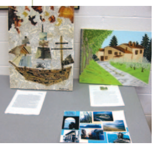
Recycled materials were used in this collage to reflect Stockholm as a sustainable city.

In addition to other assignments and exams, the 33 students in the course, mostly sophomores and juniors from a wide range of majors, were instructed to choose a city of