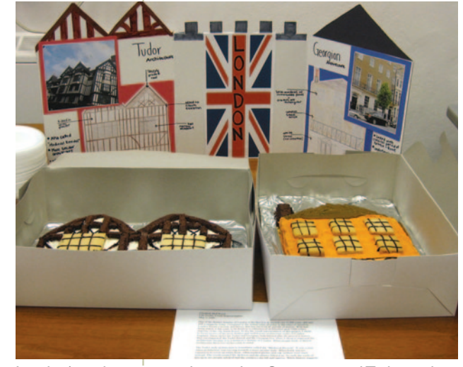
London's architecture is depicted in Georgian- and Tudor-style cakes.

three-dimensional model of the Colosseum in Rome), representative images that tell a story about the place (such as photographs of housing from different time periods in Moscow's